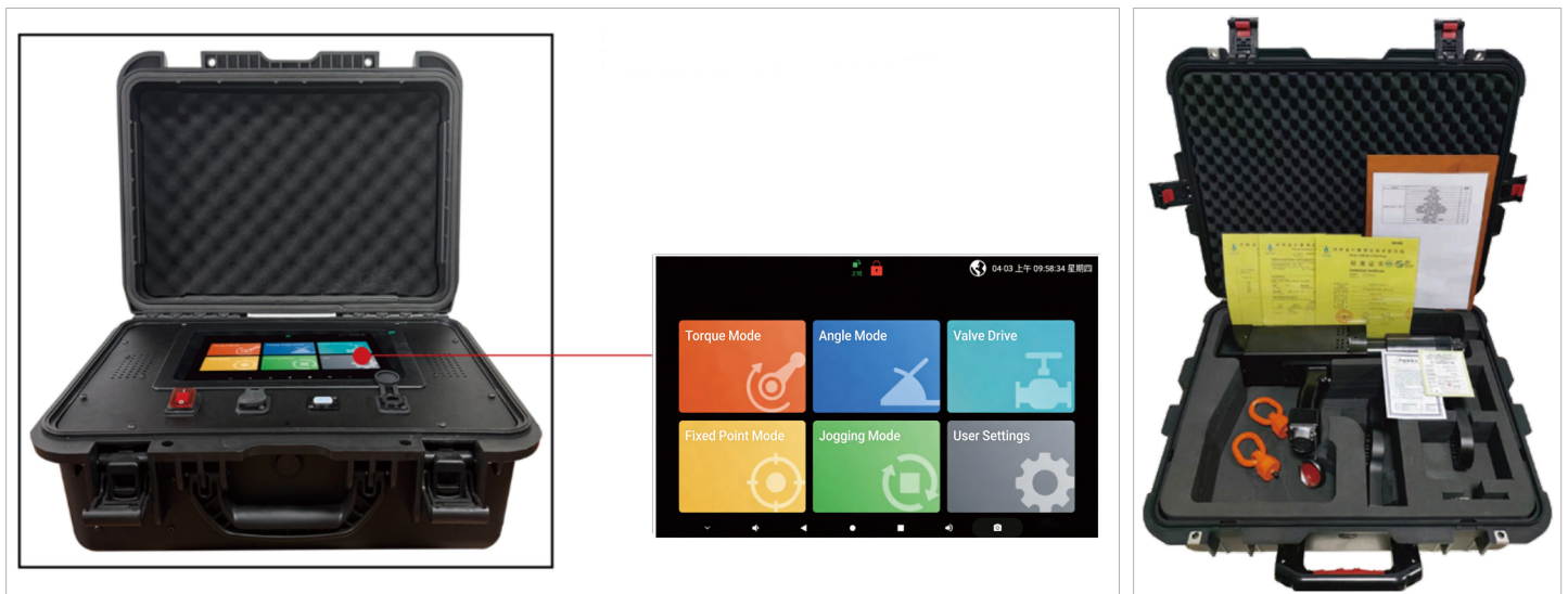
Intelligent Control Box - Main Interface

The touch screen control box allows operators to quickly set torque, configure forward or reverse rotation angles, adjust torque settings, download wrench operation efficiency data, and store all information. Data can be saved on the memory card inside the control box or downloaded to an external hard drive. An optional wireless Bluetooth data recording system enables users to store and transmit data remotely.